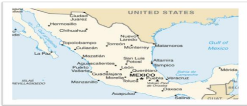
Missionaries since 1977