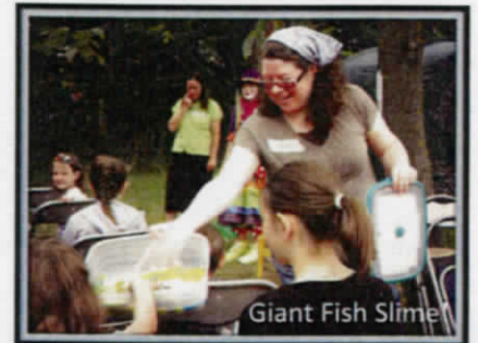
Giant Fish Slime