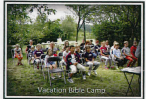
Vacation Bible Camp