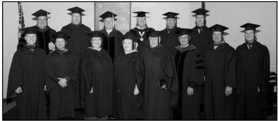
The 2009 - 2010 Faculty of Crown Southwest