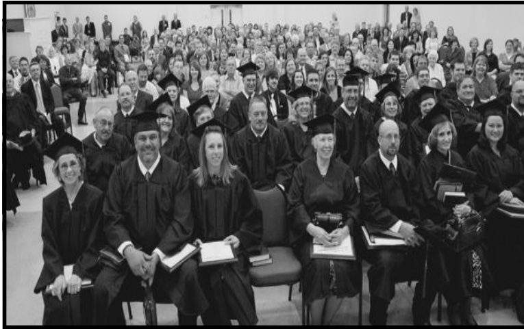
Above left: Graduates and guests at the Tuesday evening graduation service.