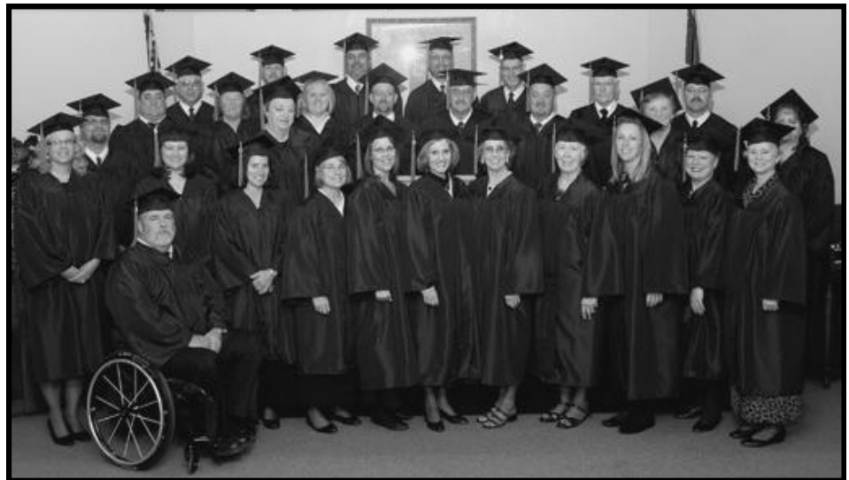
Right: The first class of 30 graduates from the Ft. Worth School of the Bible.