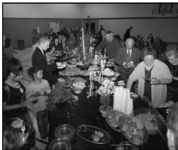
After the Wednesday evening service, which was held at Worth Baptist Church, guests enjoyed a reception.