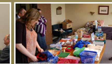
Missions Store - Thank you to all the churches who gave, you are a blessing!