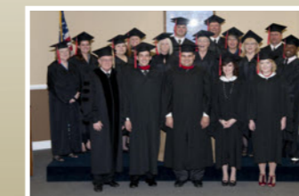
Crown Southwest & Fort Worth School of the Bible Graduates