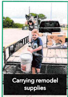
Carrying remodel supplies