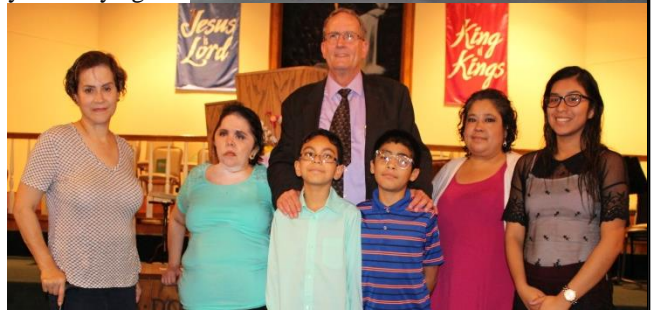
Six baptized in March!

Moral attacks: This month we found out that another Hispanic pastor fell into adultery. It seems the more we work here the more we see this happen, not only amongst Hispanics, but with Anglos as well. It is sad, and we ask that you pray a wall of prayer around us that we would always hold high the testimony of the Gospel of Jesus Christ.