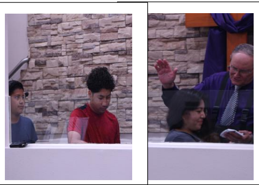
Baptisms March 2024 A mother and her two sons