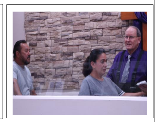
Baptisms March 2024 Husband and wife

Sending Church: Worth Baptist Church - P.O. Box 15141 - Fort Worth, Texas - 76119