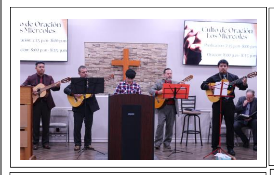
The "Rondalla" on Friend's Day