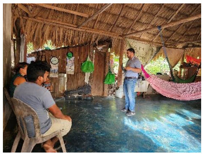
meetings with them.

shipping a container of medical supplies and about ¾ of my personal belongings.