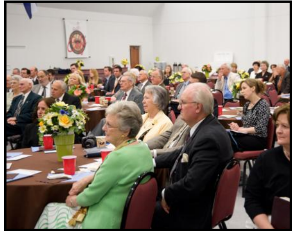
Wonderful fellowship and delicious meals