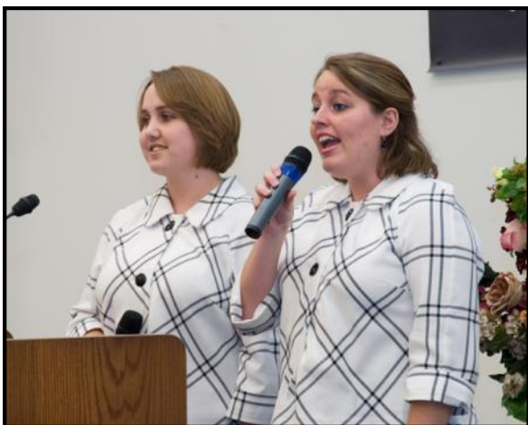
Inspirational Christ-honoring music

Wednesday, 7:00 P.M. - Service to be held at Worth Baptist Church, Fort Worth, Texas