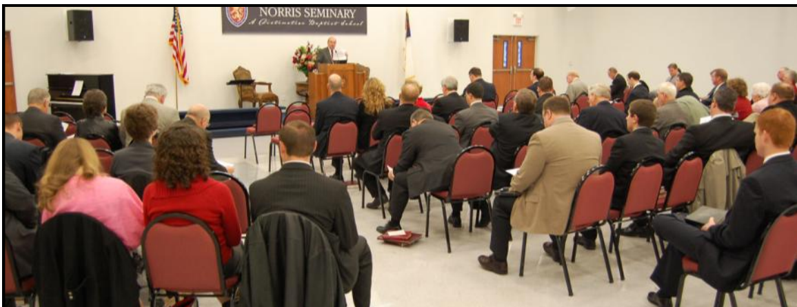
Student, faculty, pastors, evangelists, and missionaries attended, the Metro-plex Area IBF meeting the opening week of classes at Crown Southwest. The students and staff served breakfast and lunch..