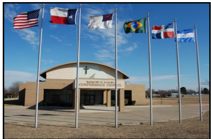
All services, except Wednesday evening, will be held at the Raymond W. Barber Conference Center.