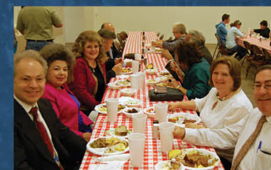
Everyone enjoyed the delicious meals prepared by the ladies of the church.