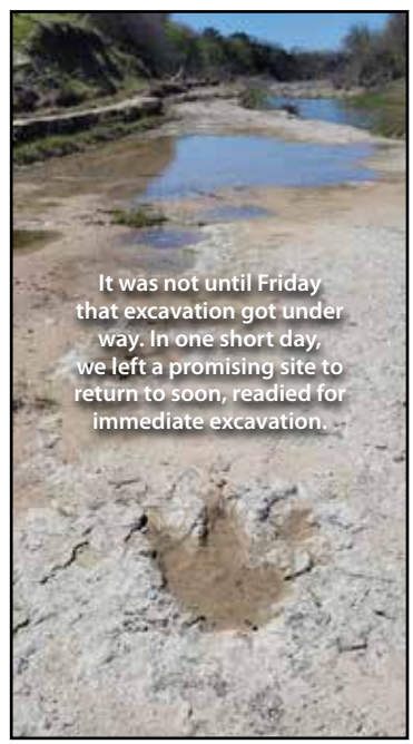
It was not until Friday that excavation got under way. In one short day, we left a promising site to return to soon, ready for immediate excavation.