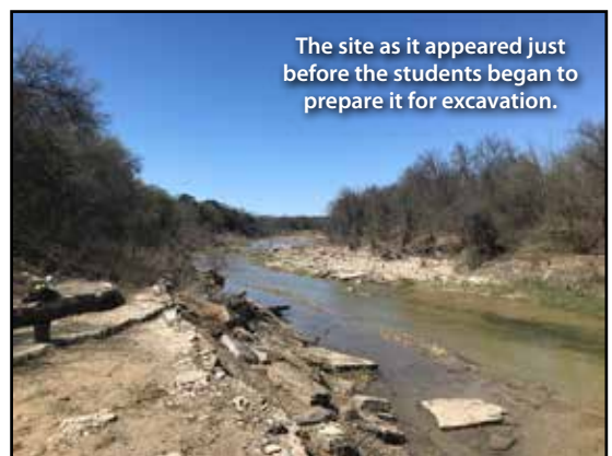
The site as it appeared just before the students began to prepare it for excavation.