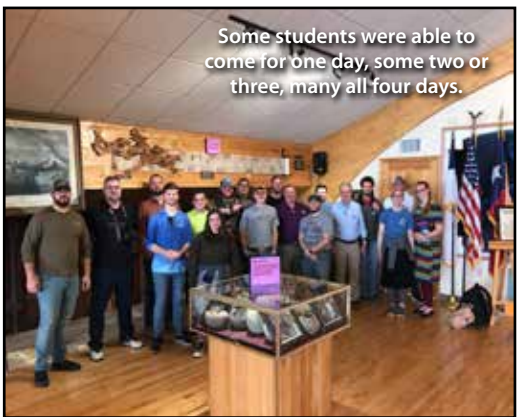
Some students were able to come for one day, some two or three, many all four days.