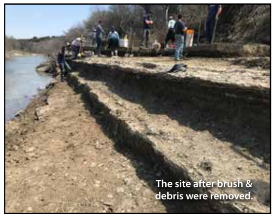
The site after brush & debris were removed.