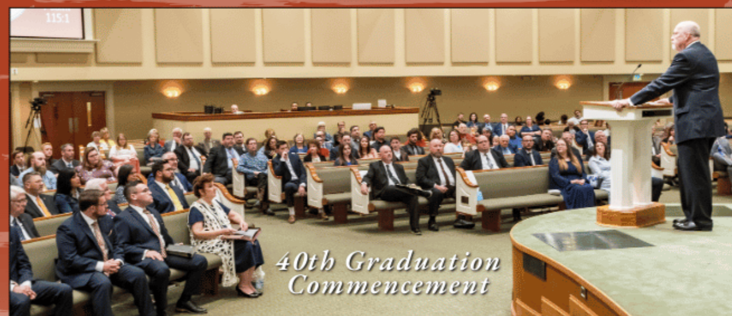
40th Graduation Commencement Heads Up! NBBS Opening Day Rally will be Tuesday, August 13, 2024 - First Day of the New School Year